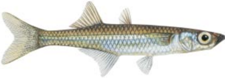
Menidia beryllina (very similar in appearance to key silverside)